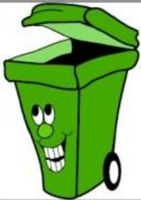
The Village wants to KNOW!!