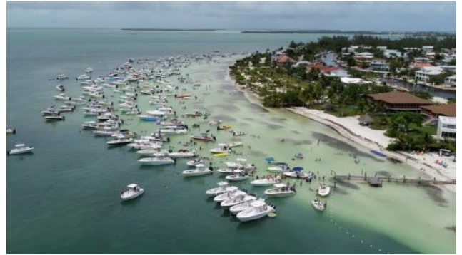
Are all these boats really from Port Antigua???

The Board proposed the Village institute a buffer area that would exclude vessels yet allow them to anchor further out in shallower water and still have room for paddle boards and such closer to shore. Due to implementation and