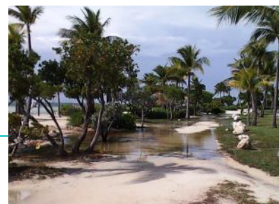
A quiet and wet Memorial Day