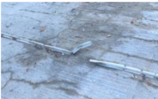
A misadjusted hitch or dragging motor and your ramp is open to all!

Association Manager Homes in Port Antigua are selling at an all time number and all time high prices! My desk is busy with requests for owner financial information. Fifteen so far this year! We