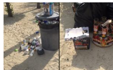
↑ Overflowing ↓

And we have a request from your fellow members: Don't hold the TIKIS's. There was one that had stuff under it from early morning to late evening one day July 4th weekend. To make matters worse, no one ever showed up!